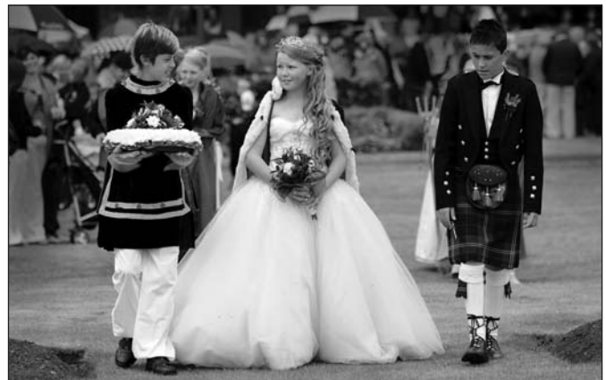
Gala Day 6 June 2009

After another successful, but slightly wet, Gala Day in 2009, arrangements are now beginning for the 2010 Gala. The Annual General Meeting will be held on Monday 26th October, 7.30pm in the Centre . Anyone interested in finding out more about this Gala Day or assisting with this event is welcome to attend. There will be a video showing of this year's Gala Day and refreshments will be available. Parents/Guardians of P7 pupils in the village are particularly invited to attend as participation in the event does involve assistance from parents.