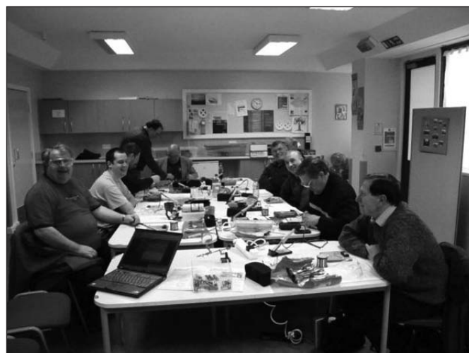
Test Night at Radio Club

Congratulations Port Seton Bowling Club!